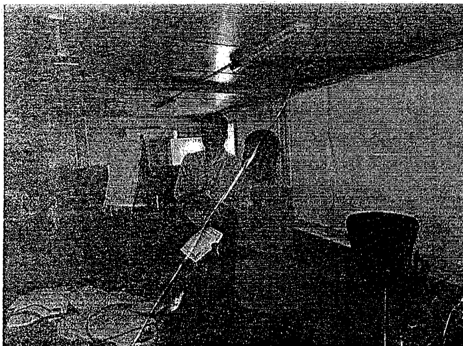
"Regional Chief CITS presenting a certificate of completion to the first female military participant in the ICT signals training Jan 27 - Feb 10, 2016 at the UN Military Signals Academy in Entebbe".